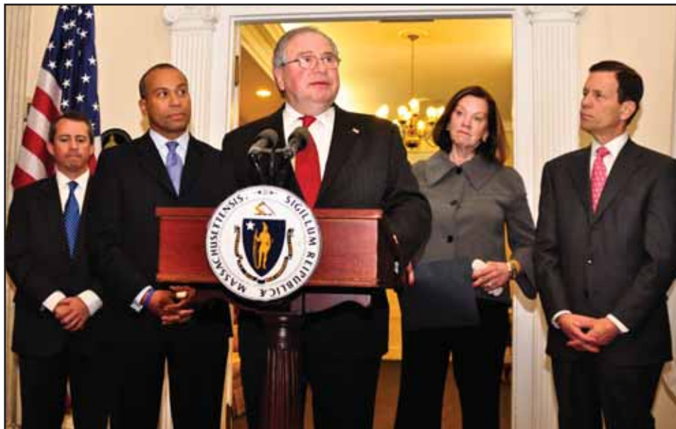
CHANGE PROPOSED Governor Deval Patrick joins House Speaker Robert DeLeo and other political leaders at a press conference announcing plans to reform the pension system. The changes will apply primarily to new hires.

Along with red ink and unemployment, the recession has also brought intense scrutiny to public sector employees, their salaries and benefits.